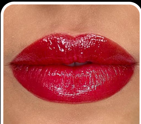
By @laylaborgesbeauty - Insane Red

more striking results. There are two pigments for lips and one pigment for eyeliner and eyebrows.