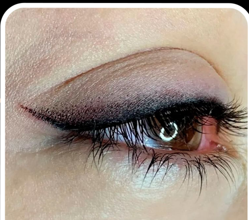
By @victorvasconcellos - Ultra Black