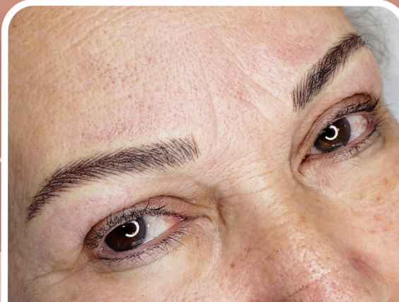
By @graziboschetti.pmuartist - Brownie Extra Dark