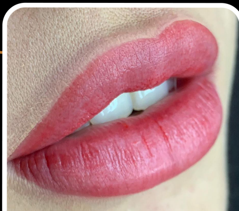
By @annarachelpmu - Insane Red