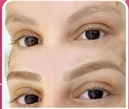
By @yeddagaldino - Universal + Hot