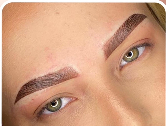
By @thayscarneiropmu - Viena + Evora